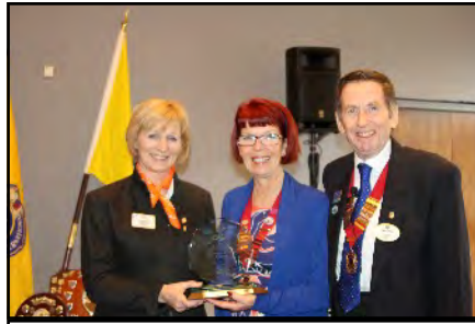
Travelling Lioness Winner Witham & District