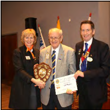
Peace Poster (Ipswich)

Resolution to increase to £11 was defeated on the recommendation of the District Treasurer.