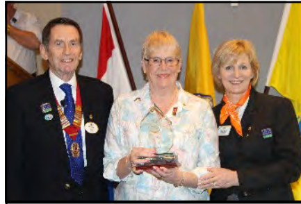
Environment Contest Lioness Winner Witham & District