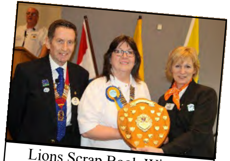
Lions Scrap Book Winner Whittlesey & District