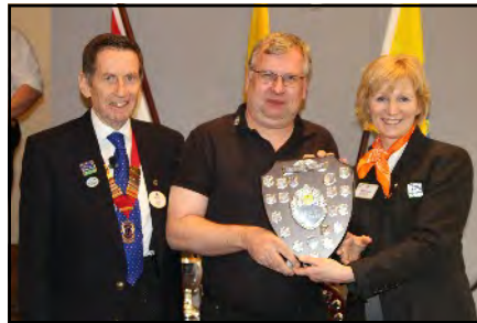
District Quiz Winner Braintree