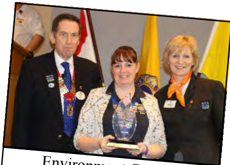
Environment Contest Lions Winner ~ New Century